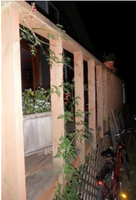
Eccremocarpus "Lopsided Chile Trumpet Vine"

Early this spring I picked up a flowering vine at a local nursery and I parked it in the ground next to our porch/deck. As you can see from the photo, it is doing its thing pretty well. Pretty well, but I bet that outside of its native Chilean habitat, my plant would like nothing better than a rasty old chain-link fence between two warehouses in SoDo.