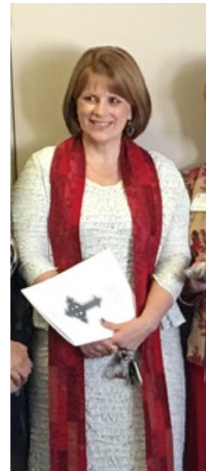
A Spirit Filled Occasion!