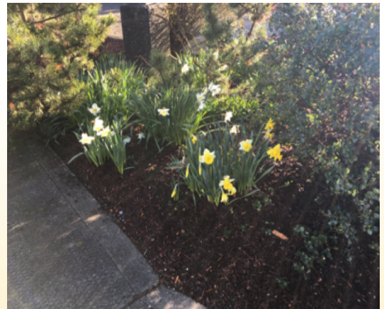
Daffodills Planted by the Cub Scouts Beautify the Church Grounds!