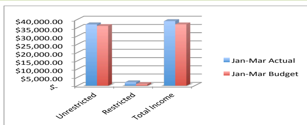
First Quarter Income (Budget vs Actual)